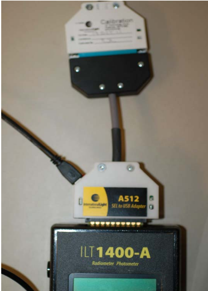
A512 Connected to 1400, Detector and USB