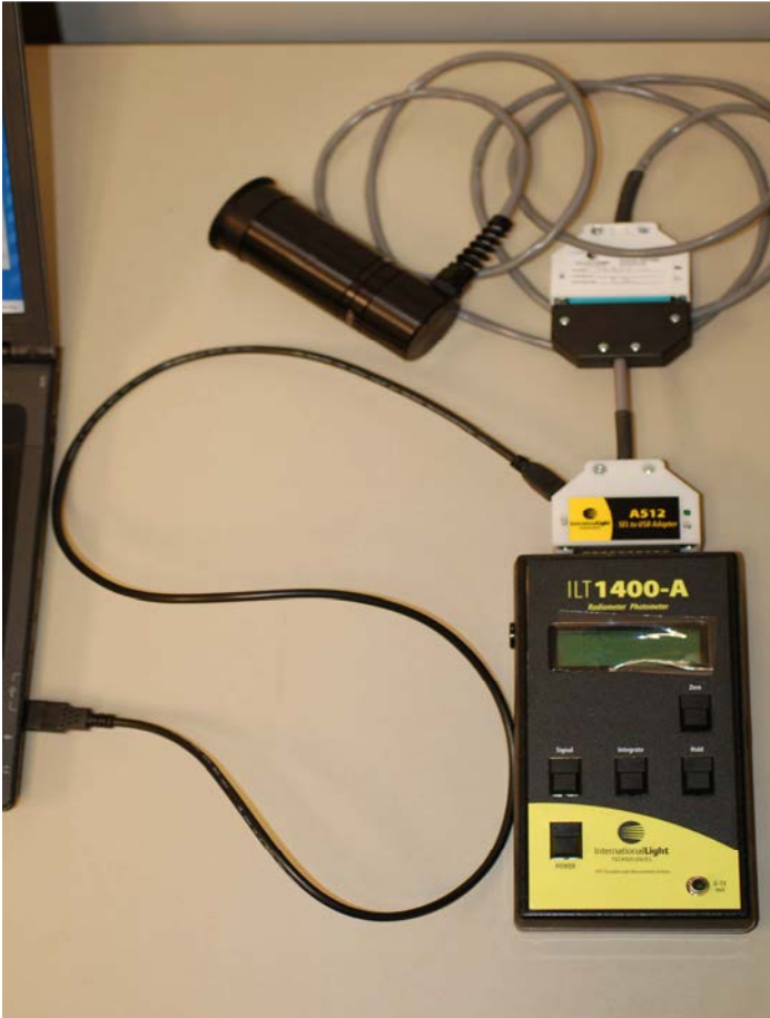
1400 System Connected to a PC