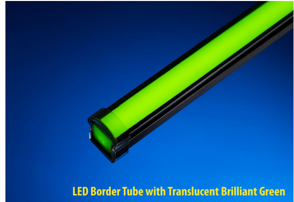
LED Border Tube with Translucent Brilliant Green