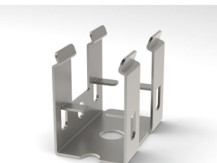
Mounting Clip: ILT-SHM30717P1

Specifications subject to change without notice.