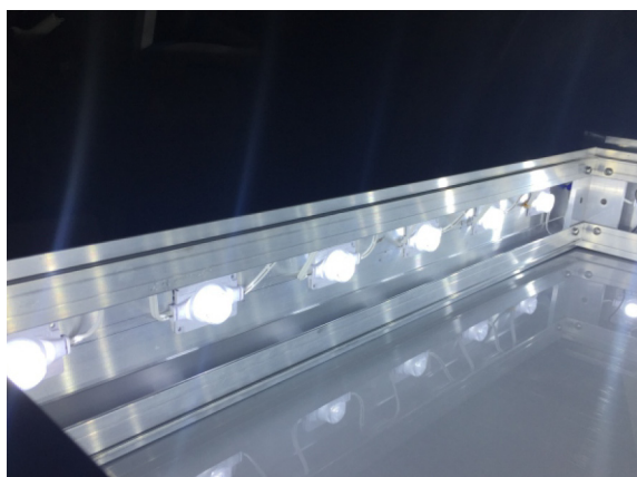
ILT-1X1-W65-025 Mounted to the perimeter of a 6" deep double faced cabinet