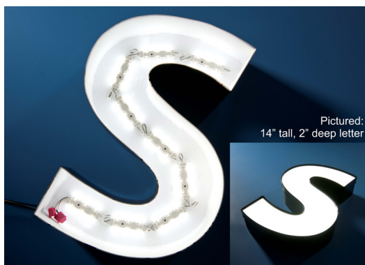
Pictured: 14" tall, 2" deep letter